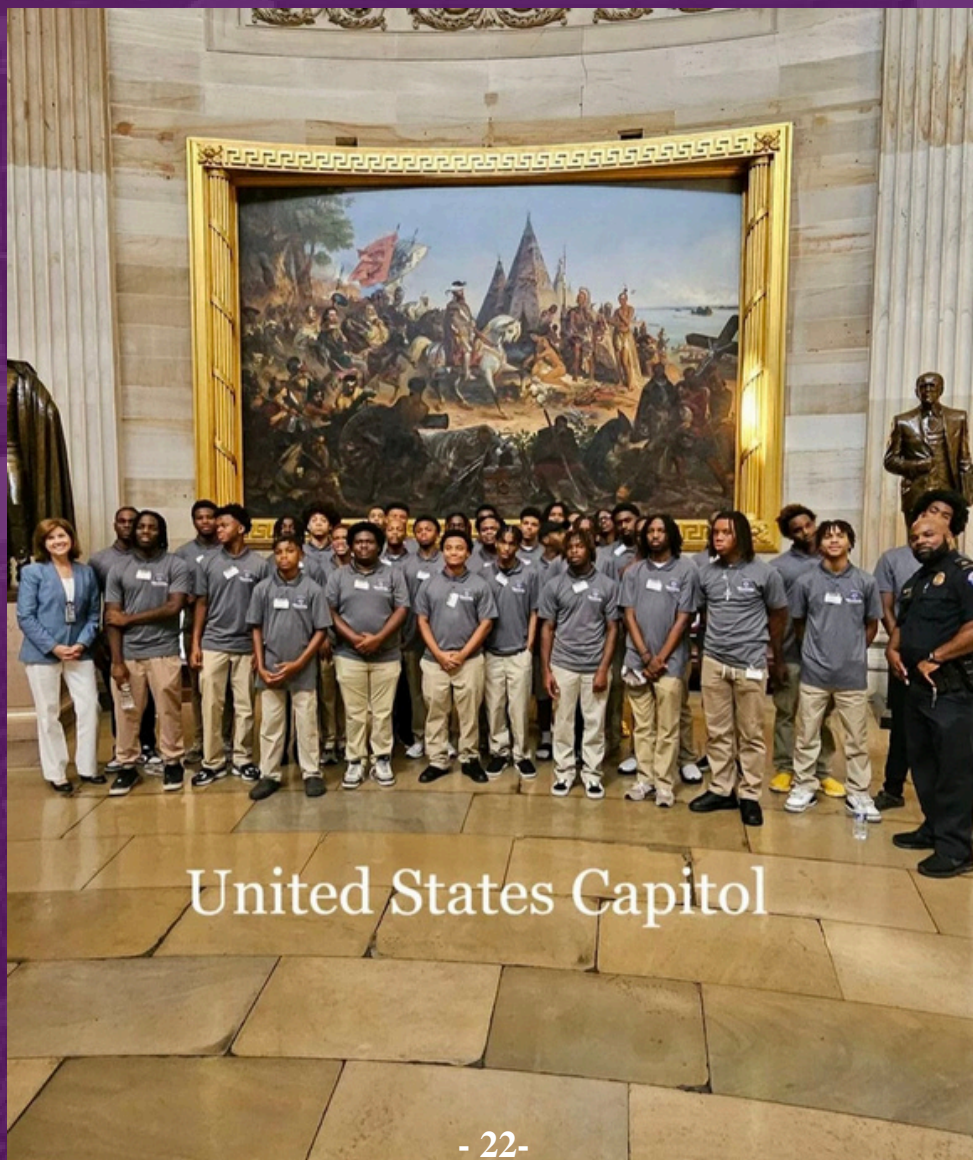
United States Capitol

In conclusion, the trip to Washington, D.C., organized by the Rho Beta Beta chapter of Omega Psi Phi Fraternity, Incorporated, was a resounding success. The combination of historical education, cultural exposure, and mentorship created an experience that was both enriching and empowering for the youth involved. The young men left Washington, D.C., not only with new knowledge but also with a sense of possibility, inspired by the history, legacy, and achievements of African Americans. The trip served as a reminder that with the right guidance, exposure, and mentorship, they too could achieve greatness.